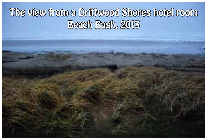
The view from a Driftwood Shores hotel room Beach Bash, 2013