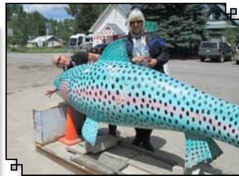
Colorado Trout, big & mean