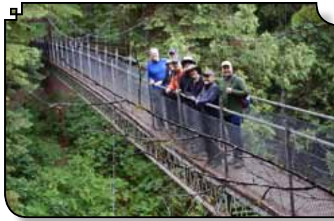
Mid-span on the bridge

Drift Creek Road is a meandering ribbon that connects US-101 with OR-18 near Rose Lodge. It climbs dramatically about a thousand feet, getting narrower and twistier the farther you travel. Especially south to north, care must be taken as you round the blind corners on a surface only a lane-and-a-half wide. This is a popular day hike and the preferred