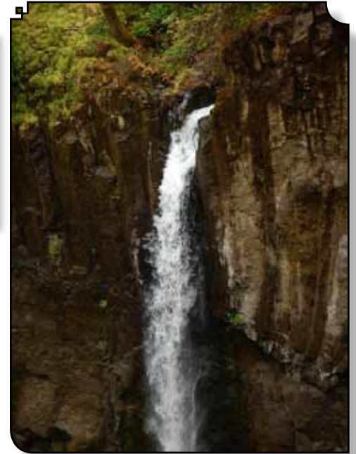
Drift Creek Falls

After pictures were taken it was time for the return hike. The