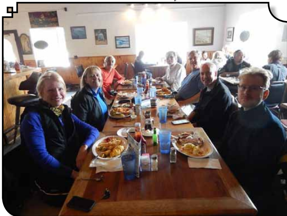
Well-fed and ready to hike.

Heading to Lincoln City, eventually one has no choice but to jump on OR-18. As we headed west, it became clear we were not going