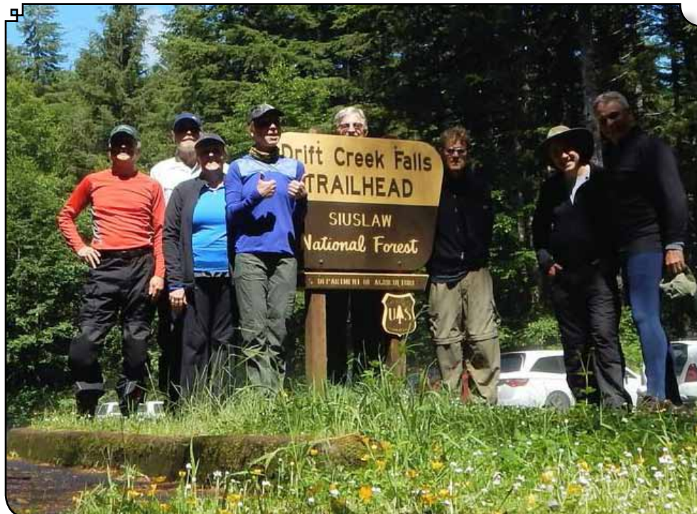
Trails End for a Hardy Group of Hiking Bikers.

Corner Café South , 6042 SE US-101, Lincoln City, OR 97367 (541) 614-1467