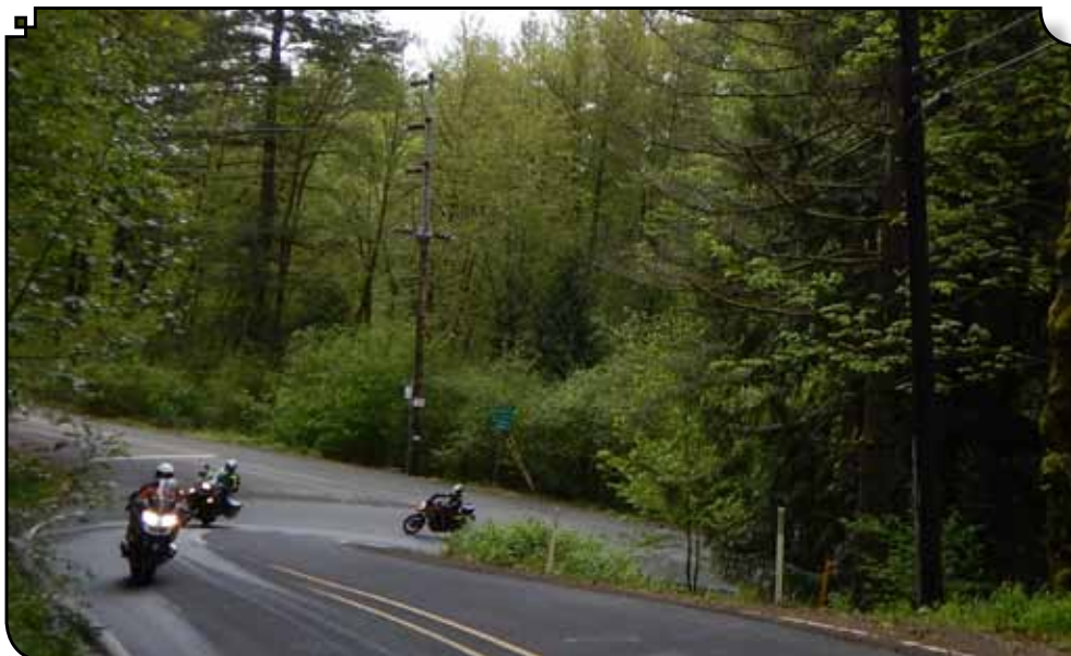
Dragging knees on Ten Eyck Road.