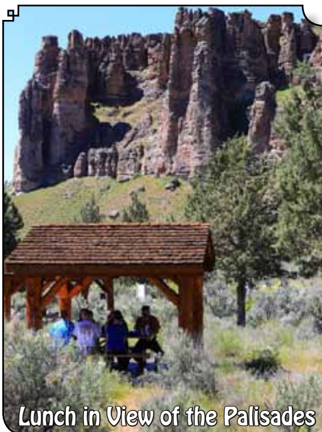
Lunch in View of the Palisades