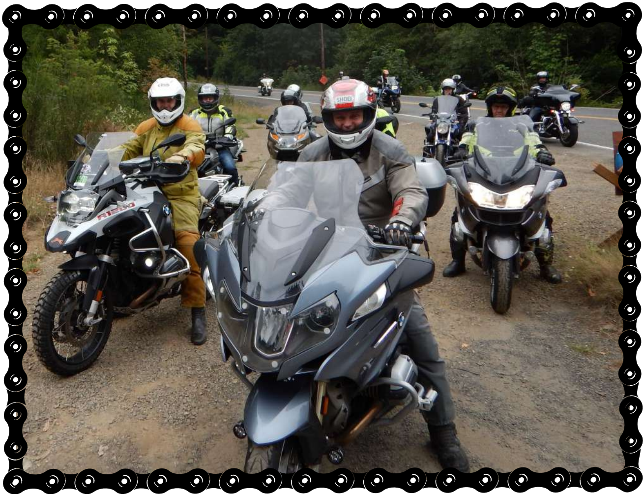
A quick pit stop near Pittsburg.