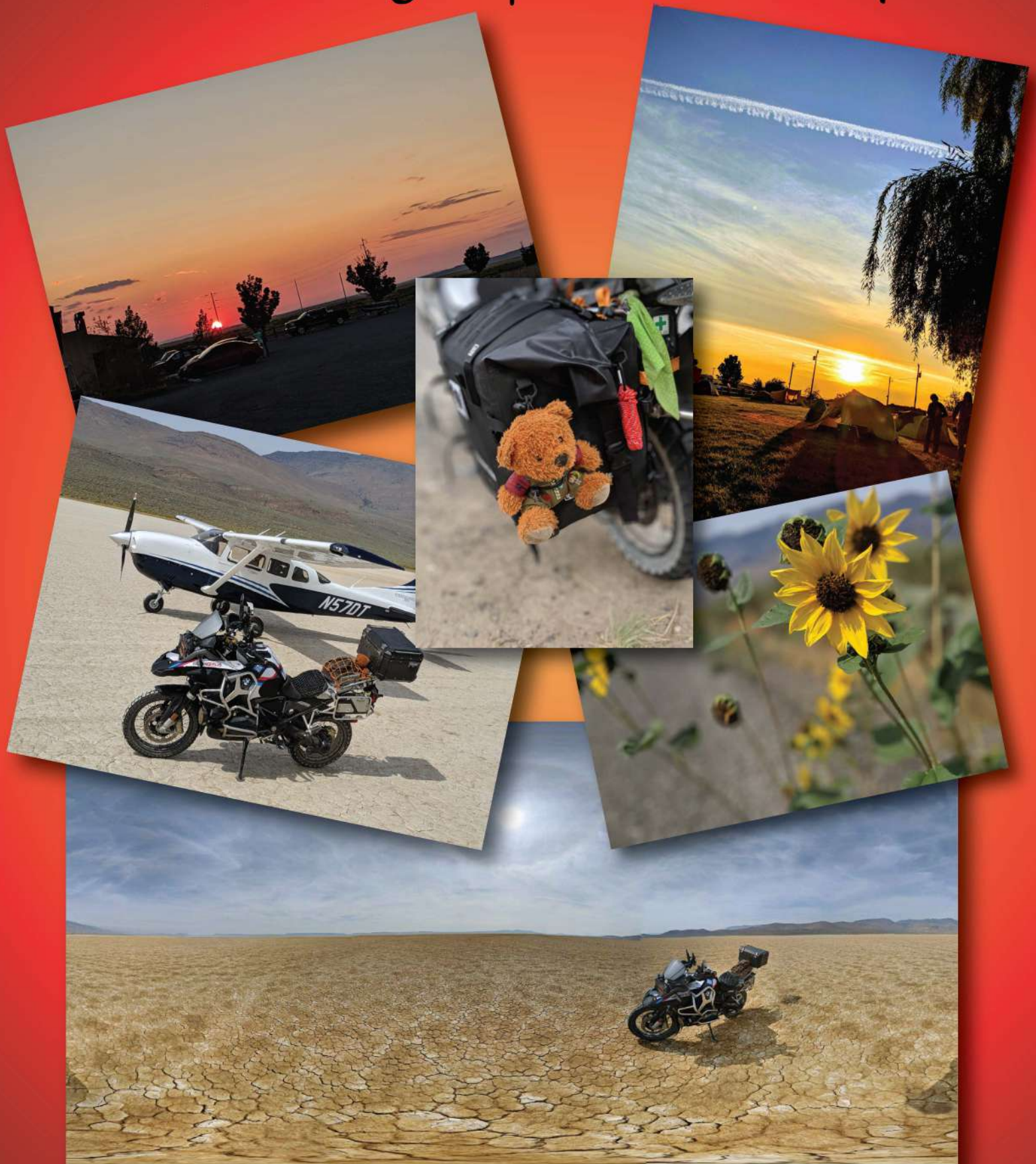
Photo Montage of Steens Campout