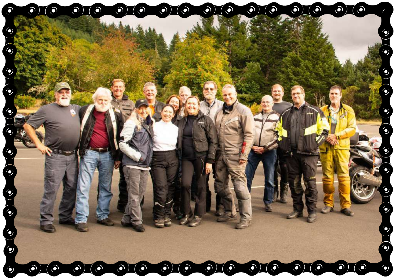
All smiles after a fun day in the saddle.